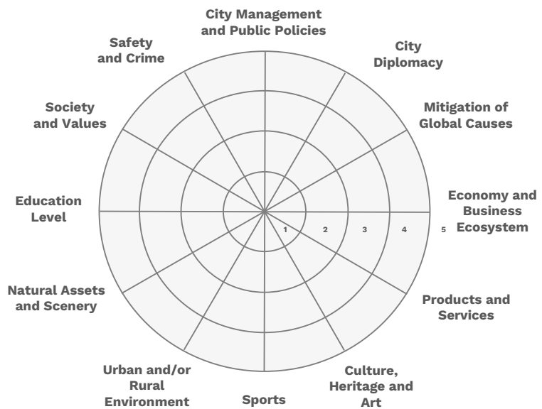
The Bloom Consulting City Brand Taxonomy Model © 2023 © Bloom Consulting - Any region is welcome to use this model.