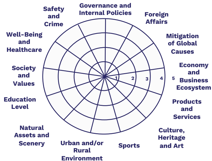
The Bloom Consulting Nation Brand Taxonomy Model © 2023 © Bloom Consulting - Any country is welcome to use this model.

Figure 5 illustrates the complete list of elements that impact perceptions about a nation and an approach for measuring each of them based on the 6-level scale 0 – Extremely negative 1 – Negative 2 – Moderately negative 3 – Moderately positive 4 – Positive 5 – Extremely positive.