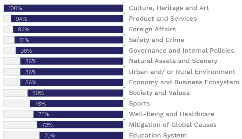
Figure 3 illustrates the complete list of elements that impact perceptions of a country.

(The percentages indicate the sum of Totally Agree and Agree responses.)