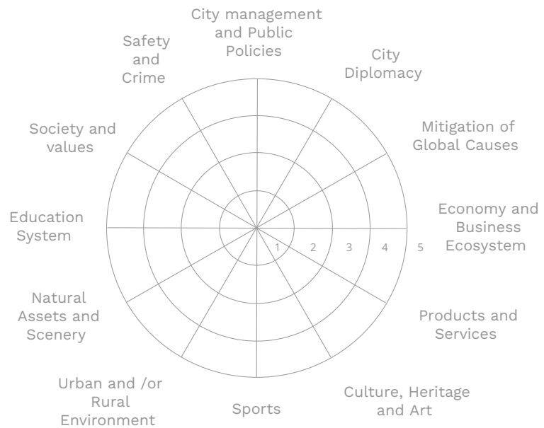
The Bloom Consulting City Brand Taxonomy Model © 2023 © Bloom Consulting - Any region is welcome to use this model.