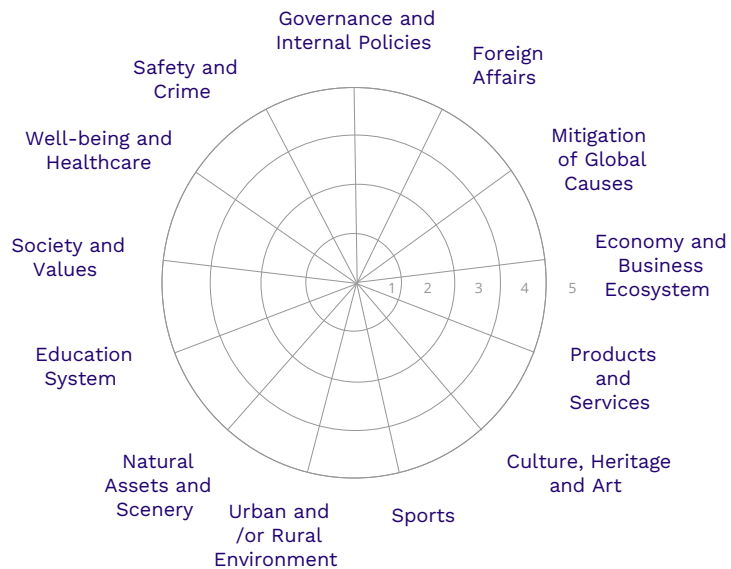
The Bloom Consulting Nation Brand Taxonomy Model © 2023 © Bloom Consulting - Any country is welcome to use this model.

Figure 5 illustrates the complete list of elements that impact perceptions about a nation and an approach for measuring each of them based on the 6-level scale 0 – Extremely negative 1 – Negative 2 – Moderately negative 3 – Moderately positive 4 – Positive 5 – Extremely positive.